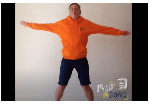
10 SECOND CHALLENGE!