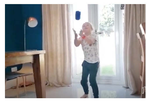
CATCH AND CLAP!